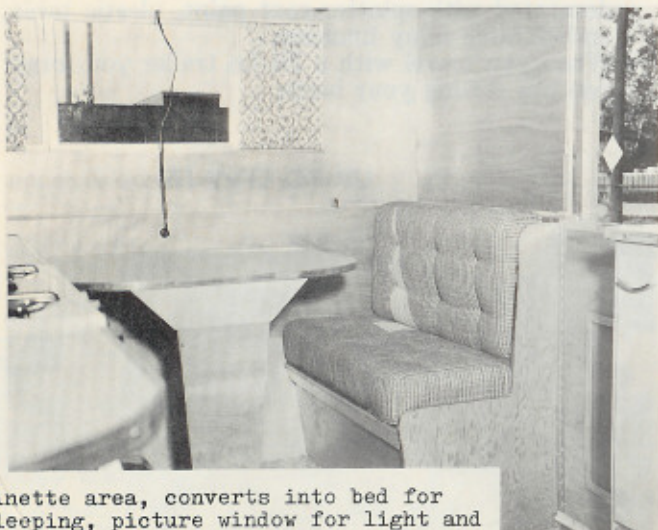
Dinette area, converts into bed for sleeping, picture window for light and ventilation