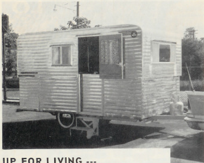
UP FOR LIVING ---

Just turn the crank -- Presto! A complete-ready-to-live-in camping headquarters for the entire family!