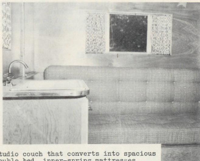
Studio couch that converts into spacious double bed, inner-spring mattresses

THE SNYDER TRAILER COMPANY, INC. • Butler, Ohio