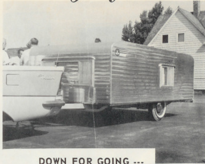
DOWN FOR GOING ---

Just turn the crank -- Presto! A complete-ready-to-live-in camping headquarters for the entire family!