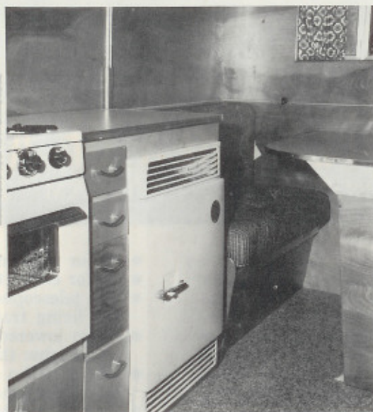
Three burner stove with oven and gas refrigerator on custom models, three burner stove and 50# ice box on standard models